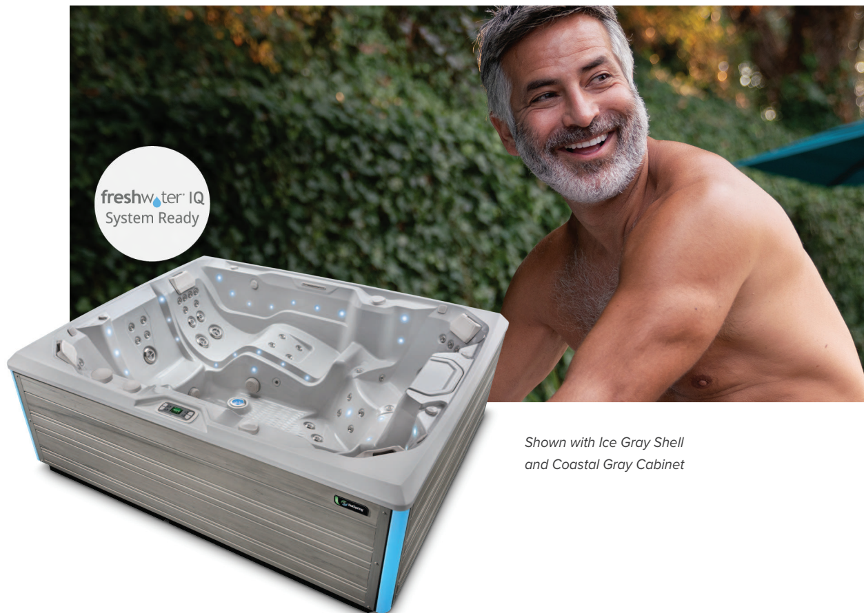
Shown with Ice Gray Shell and Coastal Gray Cabinet