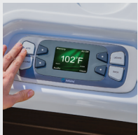
Color LCD Display